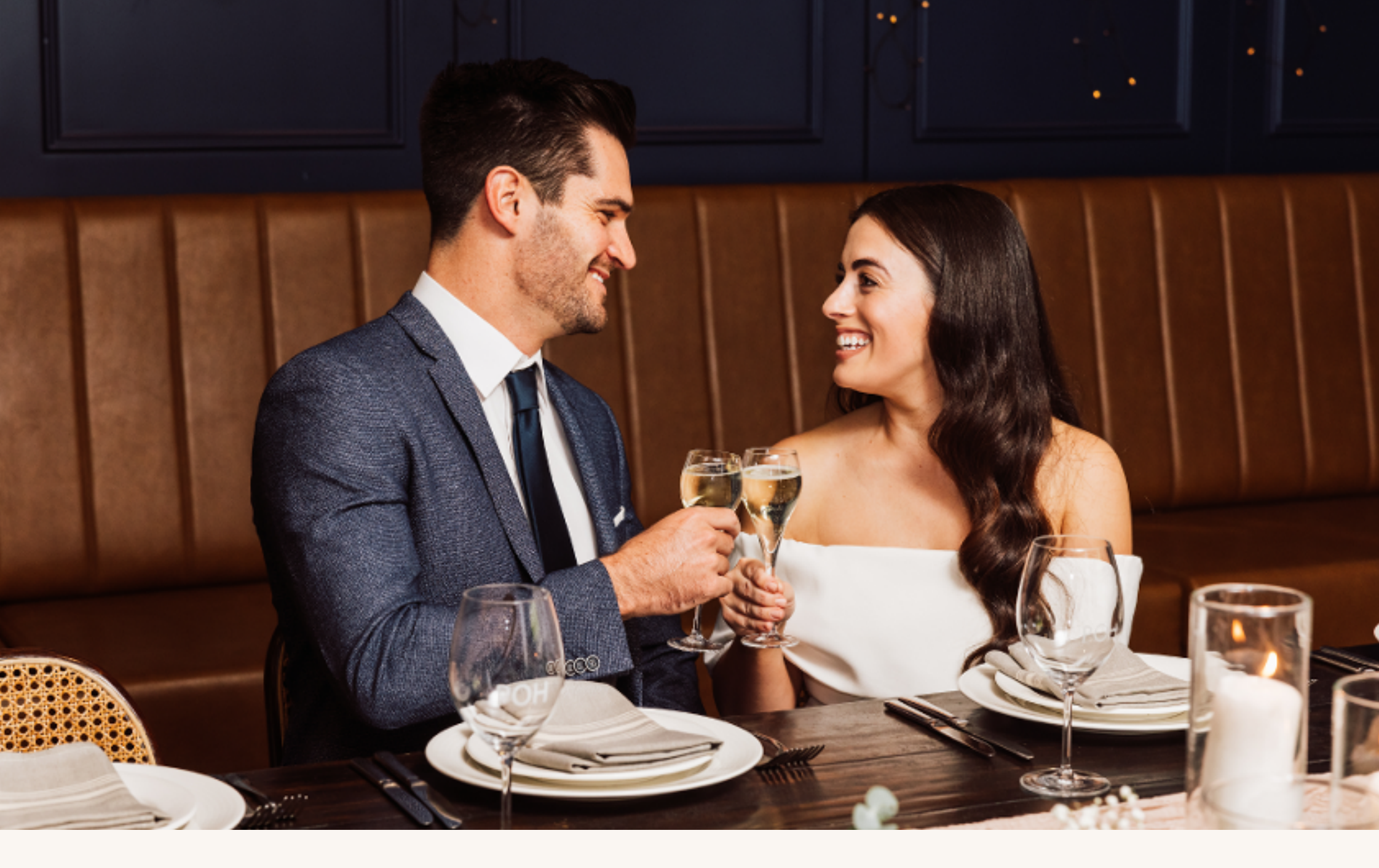
WEDDING PACKAGE | PORT OFFICE HOTEL