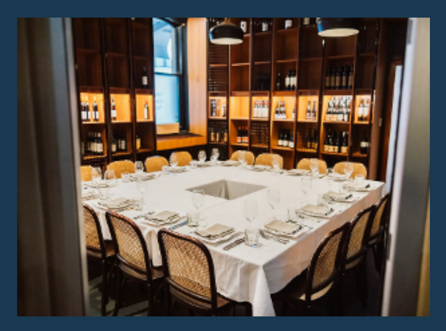
The Wine Room

Capable of seating up to 16 guests, our private dining space is perfect for surprise weddings, bridal showers, bucks parties and even micro weddings.