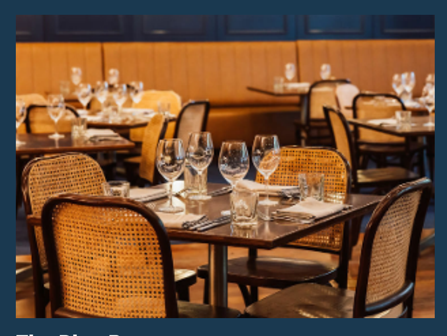
The Blue Room

Capable of seating up to 16 guests, our private dining space is perfect for surprise weddings, bridal showers, bucks parties and even micro weddings.